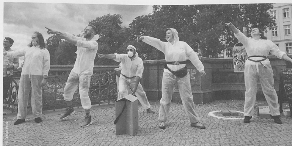
Camp Collapse / Stories from the Future (intervention 24)

A long afternoon of public pauses reversing the post-pandemic rush to normality.